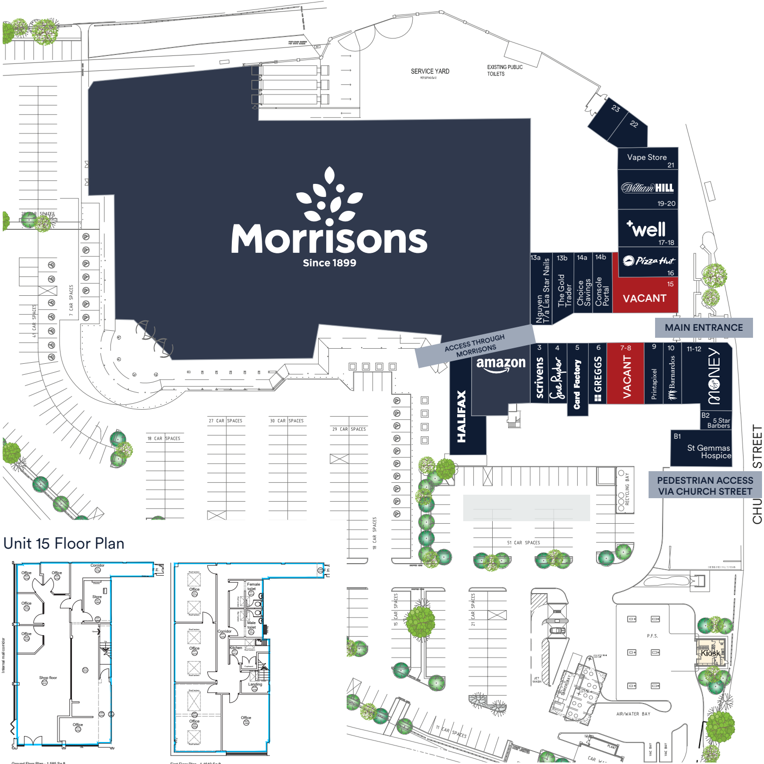
Unit 15 Floor Plan